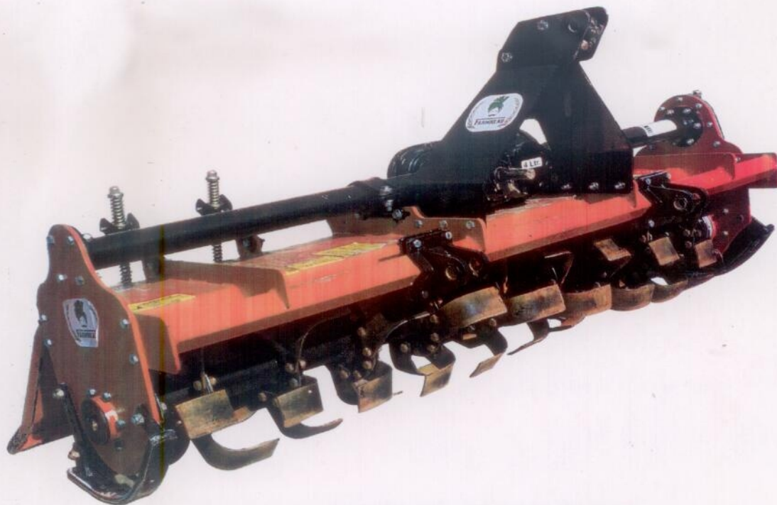
AMBBER RT-07 FT, ROTAVATOR (TRACTOR MOUNTED)

THIS TEST REPORT VALID UP TO : 31 st JANUARY, 2028